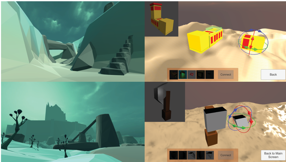
Figure 1. Game features in Homeworld Bound , our spatial skill training game. In Exploration Mode, players navigate through the Canyon (top left) and the Highlands (bottom left) to collect parts. In Construction Mode, players build equipment (Rocket Boots, top right and Sledgehammer, bottom right) using the parts they collected.

isolate and test the effects of different features on various cognitive skill enhancements [8].